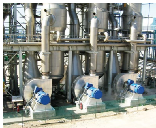
N.3 MVR blowers, Israel 2009