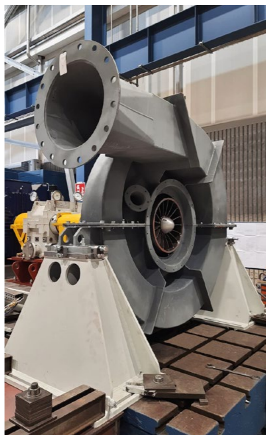
MVR blower under testing in our testing facility 2020