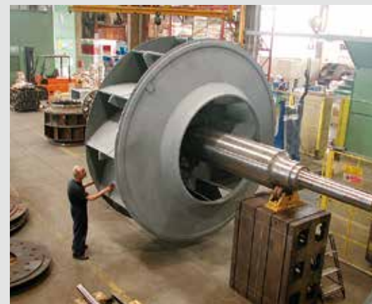
RAW MILL FAN