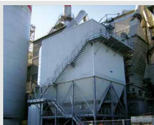
KILN AND RAW MILL BAG FILTER