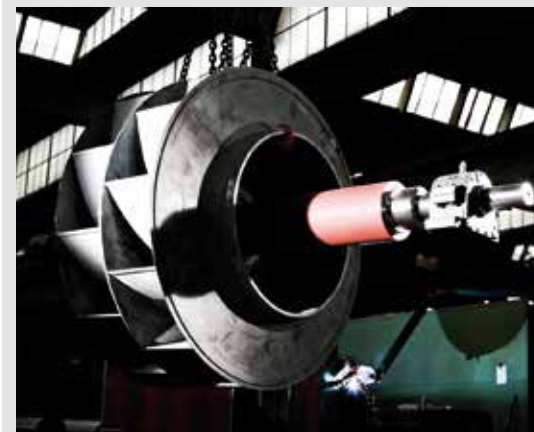
BAG FILTER FAN