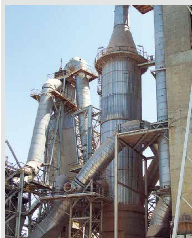
GAS CONDITIONING TOWER