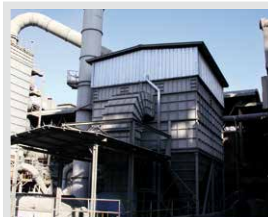
CLINKER COOLER BAG FILTER