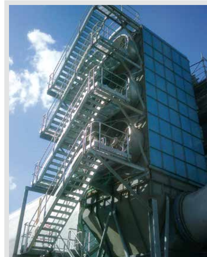
AIR-AIR HEAT HEXCHANGER

Worldwide Products • Onsite Service • Tailor Made Solutions