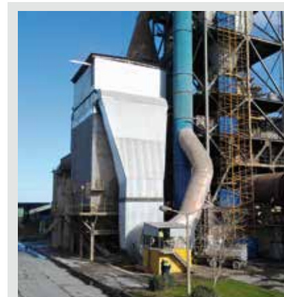
CONVERSION OF ESP IN BAG FILTER