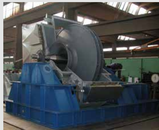
COAL MILL FAN