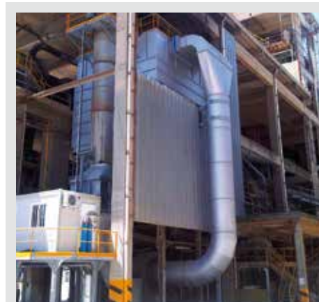
BYPASS BAG FILTER