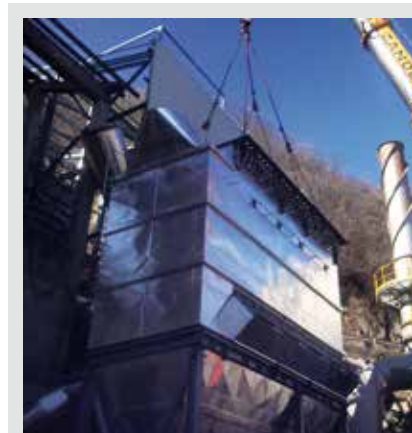
COAL MILL BAG FILTER