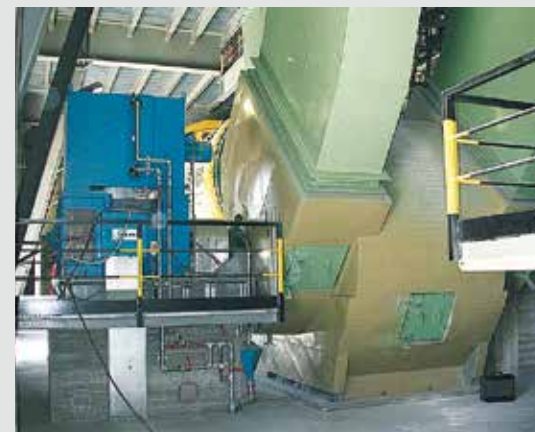
CLINKER COOLERS FAN