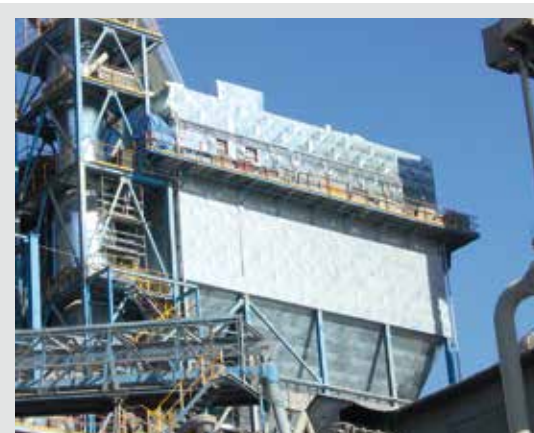
INTEGRATED BAG FILTER